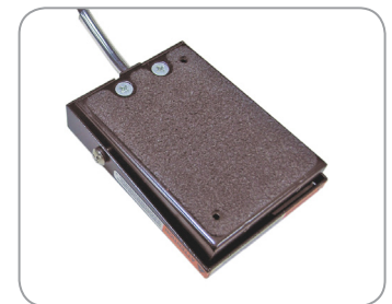
Optional hands free foot pedal.